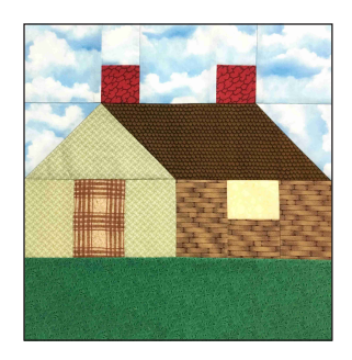
Light blue for sky. Medium green for lawn. House fabrics - your choice.